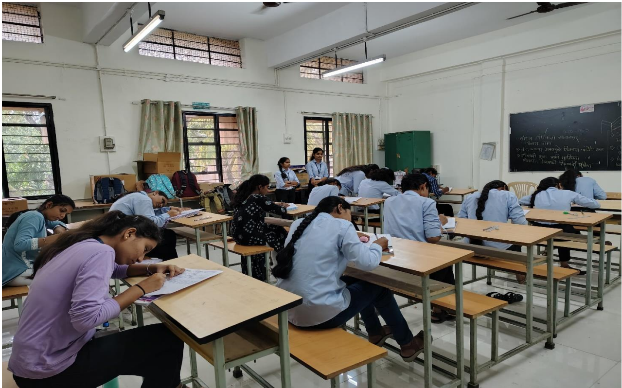
❖ Participants in Essay Writing Competition